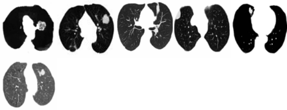
Fig. 1 Few Samples of input processed images of lung. (Above lung images are of Benign, Malignant and Normal types)

Each Lung CT image is represented by a feature vector, F ; which is comprised of 128 different parameters. The dataset contains 39 instances (exemplars) for three different classification. The classifier based on neural network is trained from the training dataset, where a feature vector is mapped on to a particular class or name of the Lung disease. The neural network learns from data (training exemplars) and the connection weights and biases are estimated as a result of this learning. After training of the neural network, its connection weights are frozen and latter; it is tested on a different dataset, which was never presented to the neural network. Here, this dataset is known as a cross-validation (CV) dataset. The performance of the classifier based on neural network is evaluated on the basis of some metrics, such as, MSE, NMSE, Classification Accuracy and Confusion Matrix. In this work, the prototype model of the classifier is developed with a view to discriminate between 3 different lung diseases. However, the proposed algorithm can be easily applied for classification of more than 3 lung diseases provided that one has enough computational resources. The feature vector, which is to be extracted from the separated ROI of Lung image, is as follows.